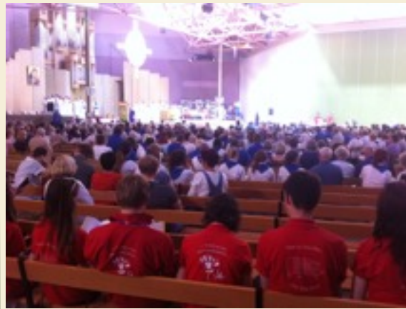
The opening Mass at the Cote Grote on Friday afternoon...

After lunch, we all went to different places. Groups went to the Accueil, the water walk, to sing at the baths, and to two different hotels (the Padoue and the Espagne)